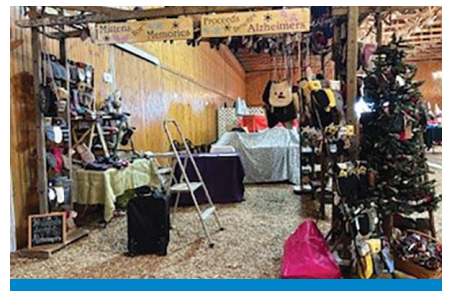
Above: Set up at the Highland Meadows Barn the first weekend in November, 2023. Below: Set up at the Sewickley Fall Festival.

With our mission we not only give to charities close to our hearts, but enjoy our weekly gatherings of sewing and