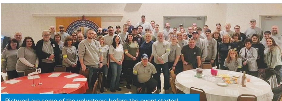
Pictured are some of the volunteers before the event started