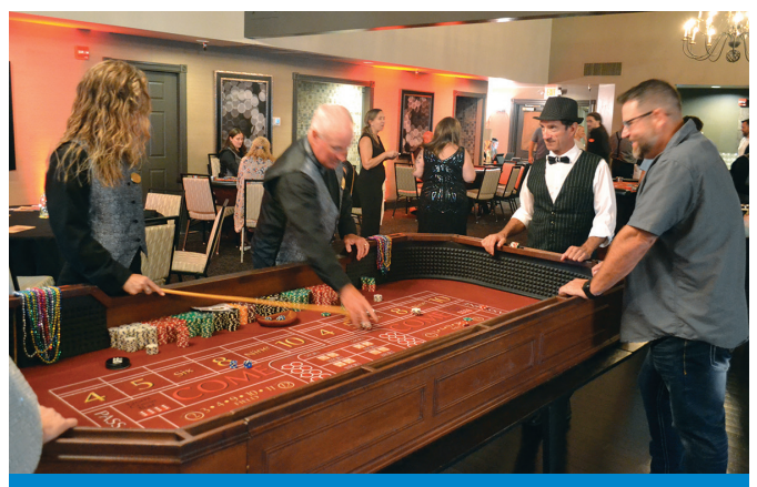
Attendees at the Craps table during the Casino Night fundraiser.