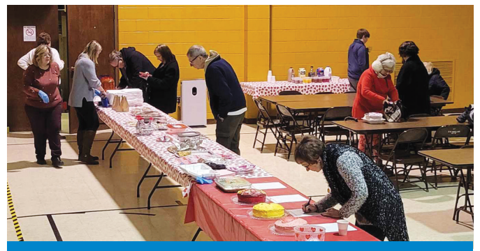
Bake sale and cake decorating contest.